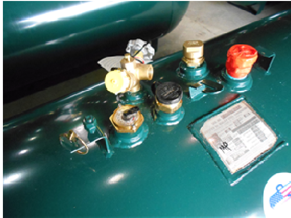
New AG/UG Tank – Glossy